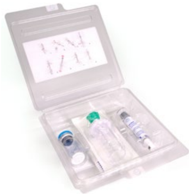
All-inclusive portable kit