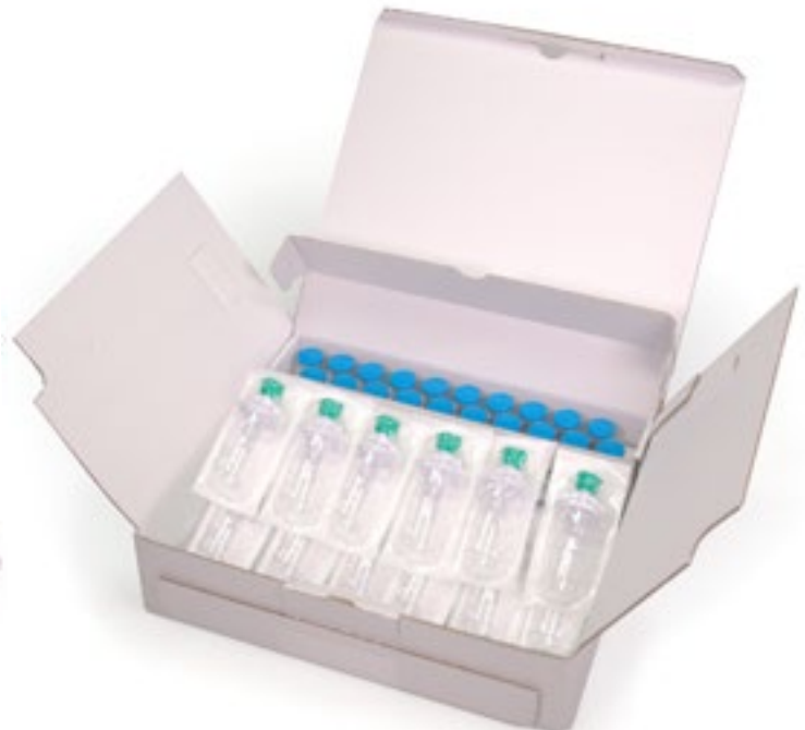
20 vials & 20 spike pack